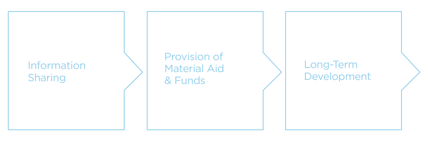
Figure 1: Evolution of diaspora response efforts

The Sudanese diaspora response to the crisis has spanned most sectors and activity types, largely due to the fact that the diaspora itself is extremely diverse in its areas of focus, professional backgrounds, and connections inside Sudan. One notable aspect of the diaspora response to the humanitarian crisis in Sudan has been its evolution of response modalities to match the current stage of the conflict and its corresponding needs.